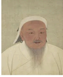
C: ?? - 1227