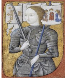
B: 1412?? - 1431